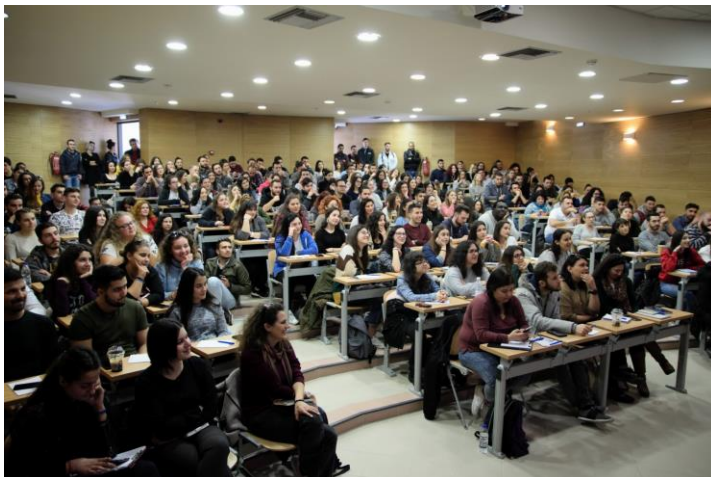
Photo from the University Seminar in Crete

http://https://learndigital.withgoogle.com/greektourism/certification